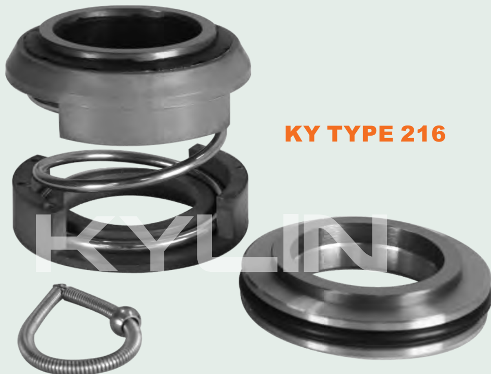
KY TYPE 216