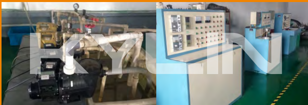
Seal testing system