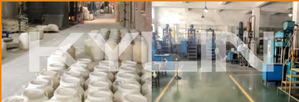
Spraying & granulating